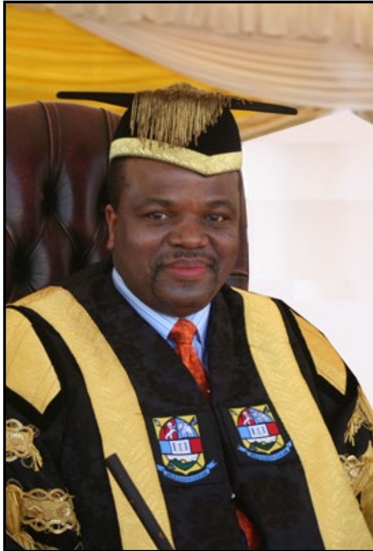
HIS MAJESTY KING MSWATI III CHANCELLOR