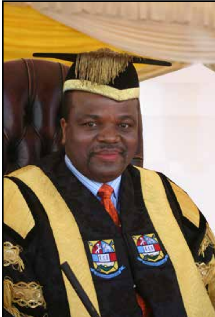
HIS MAJESTY KING MSWATI III CHANCELLOR