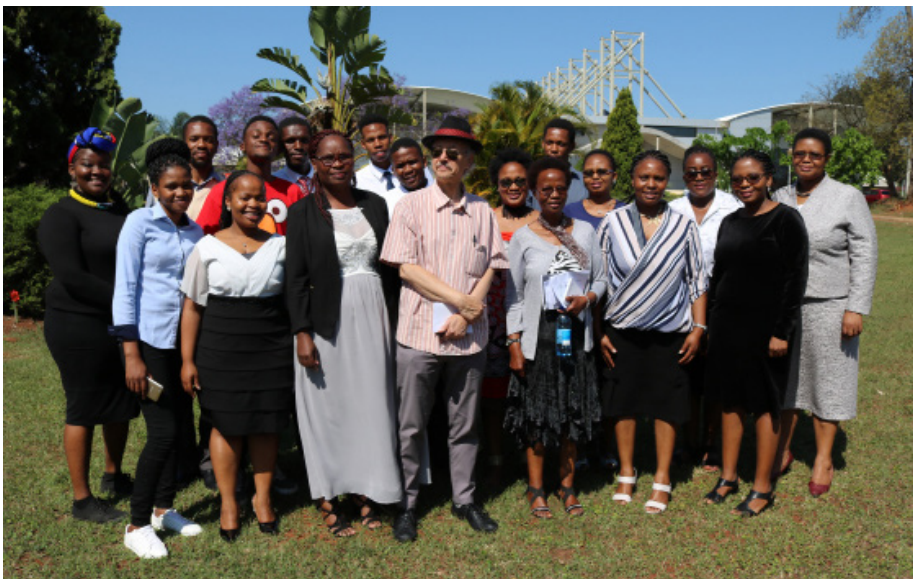
A group photo of the attendees