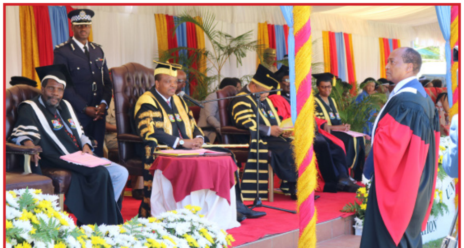
Dr Patrice Tlhopane Motsepe receiving his honouray degree of Doctor of Laws honoris causa from His Najesty King Mswati III

Your Majesty and Chancellor, on behalf of the University Council and Senate, I am pleased to present Dr Patrice Tlhopane Motsepe, a distinguished mining magnate, an eminent entrepreneur, businessman philanthropist, and University of Eswatini's most prominent alumnus.