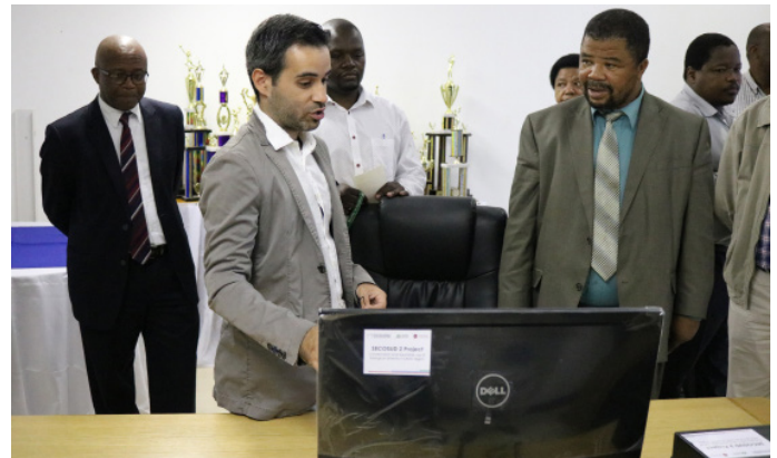
A SECOSUD II representative demonstrating to the Vice Chancellor how to operate the computer