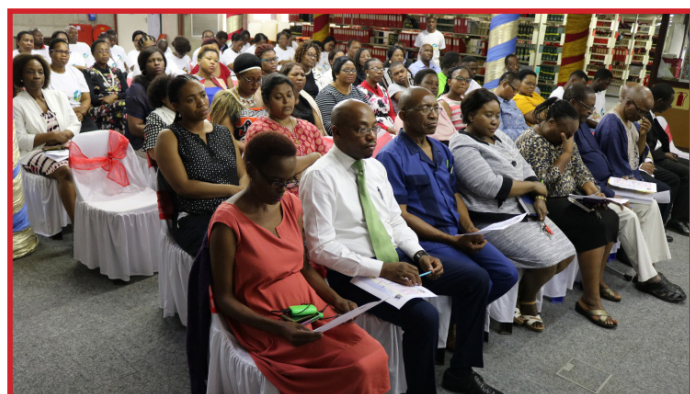
A section of Staff members who had attended the opening of the Library Week