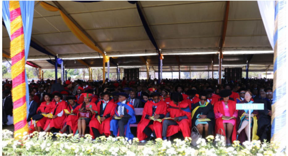
A section of the University Senate at the 38th Cogregation enjoying the proceedings

Your Majesty and Chancellor, in 1994, Patrice Motsepe founded Future Mining which grew rapidly to become a successful contract mining company. In pursuit for excellence in business, Dr Motsepe formed ARMgold which listed in the Johannesburg Stock Exchange in 2002.