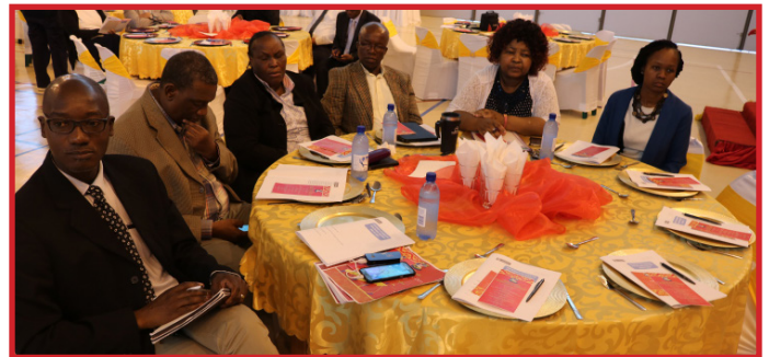
The Consultant and some University Council members listening attentively during the launch