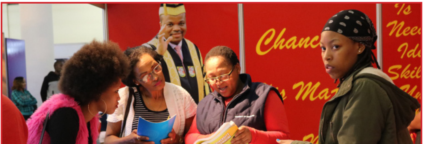
The UNESWA stall was always a hive of activity during the course of the Trade Fair.

During the presentation of prizes on Monday 10 September 2018 UNESWA received position three in the education category with Macmillan receiving position 1 and Limkokwing University of Creative Technology receiving position 2.