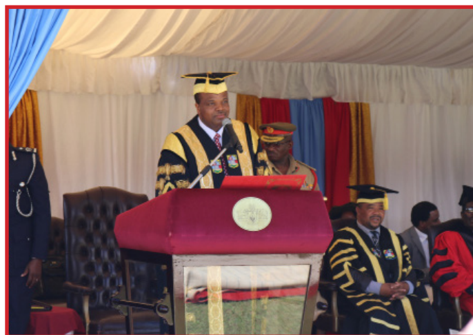
His Majesty King Mswati III delivering his speech during the 38th Congregation held at UNESWA Kwaluseni Campus

Making the acceptance speech on behalf the three honorary graduates was Dr Motsepe who thanked the King and the Swazi Nation for hosting them during the apartheid era. He mentioned how they learnt a lot from the Swazi people during their stay. Dr Motsepe donated E 10 million to the University for its further development. The donation was well received as the Chancellor and the Vice Chancellor acknowledged it in their speeches.