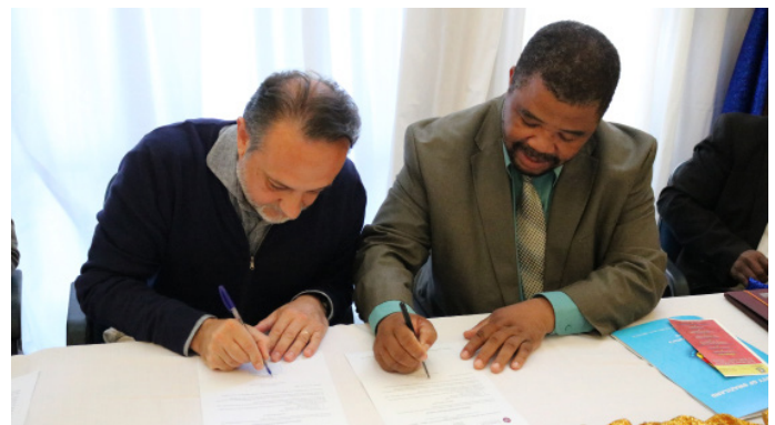
An MoU was also signed on the day to strengthen the relationship between the two institutions

The main focus of monetary policy currently was price and financial stability the world over and so this was also true for CMA monetary authorities. Given this, the Governor explained how price and financial stability were linked with economic growth in the CMA. The lecture ended with highlights on the challenges facing the CMA, such as sluggish economic growth as well as threats to financial stability. The latter was brought about by a variety of factors which include proliferation of virtual currencies (Bitcoin). He indicated that all these challenges require concerted effort in the monetary union.