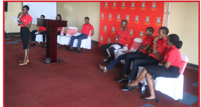
UNESWA students sharing knowledge of the University during a panel discussion held at the Fair.

Career guidance teachers and prospective students would inquire on programmes and the Team would provide the services to prospective student and the teachers. The Swazi public including the media houses and high school students were intrigued by the presence of students in the stall. Three media houses interviewed the students on their experience and congratulated the University on using them to market its