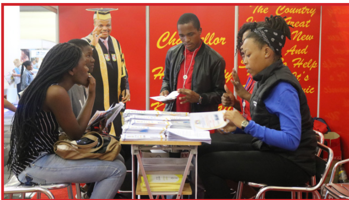
Some of our student volunteers in consultation with public at the university’s stall during the EITF 2018

• Parents and students had hoped that the Student Finance Office would be present at the Fair as