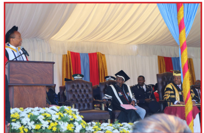
Dr Patrice Tlhopane Motsepe making his remarks during the 38th Congregation