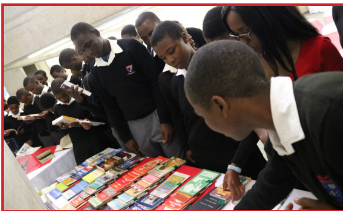
Students viewing books on display during the Library Week

During this week, the Library reflected on its achievements and showcased how it supports the University and national development through effective information service delivery. A video which traced the historical development of the Library from its inception to date was aired throughout the week and highlighted the development of the library infrastructure, growth of the information resources, library services, and staff development.