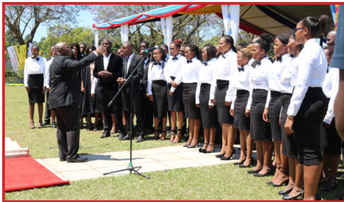
UNESWA's Choral Society delivering entertainment during the event

Graduation is a time of celebration and triumph and marks the end of one phase and the beginning of the next phase.