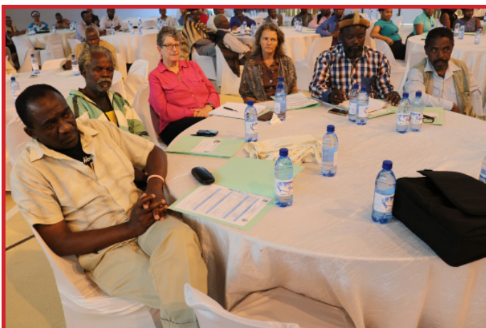
People from all spheres of life attended the event in numbers

EIRMIP passes her gratitude to the Eswatini Environment Authority for co-hosting and financially supporting the national seminar. Special thanks also go to the University of Eswatini Management for their financial support and assistance towards the seminar. We would also like to thank the UNESWA Events Management Committee for the pivotal role they played in making the seminar a great success.