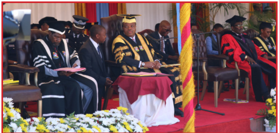
A section of the podium during the 38th Congregation

We are pleased that UNESWA has significantly increased student enrolment in post-graduate