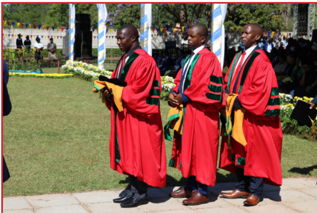
The University's first PhD graduates making their way to the podium during graduation

We also look forward to the awarding of Honorary Doctorates to three distinguished persons for the good work they have done for the University and the country at large.