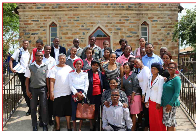
Faculty of Health Sciences' Nursing Year 4 students and Staff posing for a picture with St. Joseph's Teachers