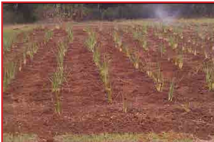
The vetiver seedlings two months from planting

Corporation was also kind to the Department as delegates were given permission to visit the treatment plant during the field excursion. MTN also contributed towards the success of the conference. Different sectors and government ministries also sent through delegates, which also went a long way in ensuring the success of the conference, especially through their participation. Furthermore, the local participants were very happy with the conference and training; the exposure and exchanges with other experts.