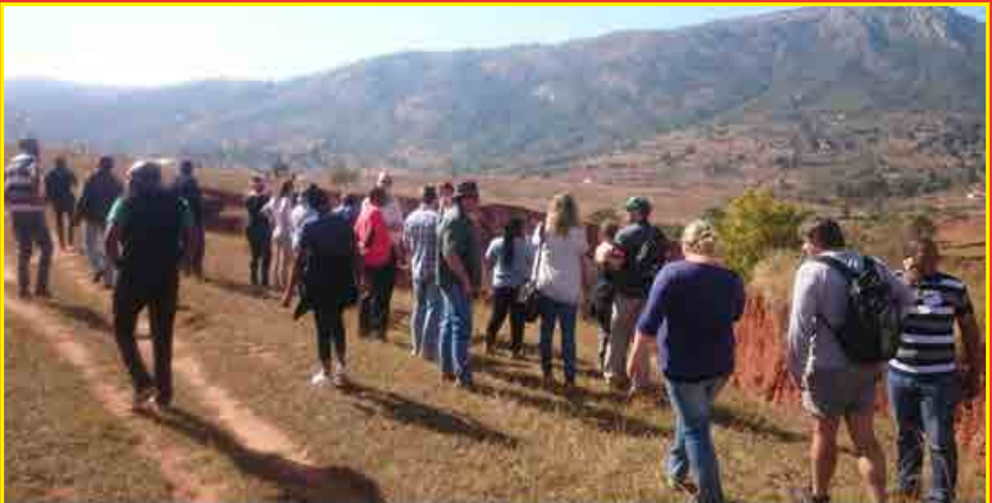
Delegates assessing a gully at Ezulwini during the post conference field excursion

Besides the numerous support SAAG received from the University and the international partners in order to successfully host the conference, there was great support from local organisations too. The Vice Chancellor supported the conference by welcoming the delegates on the evening of the 25th through a Meet and Greet cocktail, to which the department is truly grateful for. Amongst other key sponsors was Swaziland National Trust Commission (SNTC), which was the main sponsor for the conference dinner that was held on the 26th. Swaziland Water Services