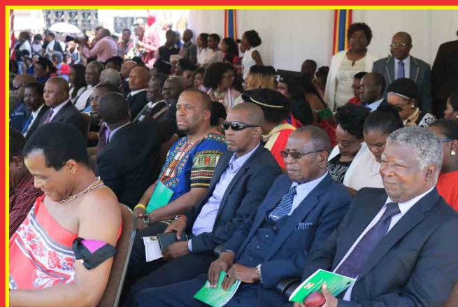
Invited VIP Guests looking on during the Graduation Ceremony

The rains did not dampen the excitement that comes with the graduation ceremony each year. Over 6 000 people attended graduation and the mix included members of the Diplomatic Corps, Cabinet Ministers, Judges of the High Court of Swaziland, Members of Parliament, the private sector, UNISWA Staff and Students, parents, guardians and well wishers.