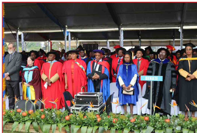
The University of Swaziland Senate signing the National Anthem during the 37th Graduation Ceremony on 7th October 2017