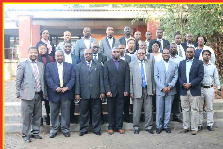
A group photo of the UNISWA and SPTC delegates who attended the UNISWA-SPTC MoU signing ceremony

The University of Swaziland, (UNISWA) and the Swaziland Posts and telecommunications (SPTC) signed a Memorandum of Understanding (MoU) on Wednesday 02 August 2017 at the New Wing, Kwaluseni Campus. The MoU anticipates fostering collaboration between the two Governments Parastatals in the area of Information, Communication and Technology (ICT) through the ICT Academy which would be housed in the Department of Computer Science, Faculty of Science and Engineering. Before the signing of the MoU, senior official from both parastatals took a site tour of where the ICT Academy would be located, a computer laboratory which had a seating capacity of 30 students. Although the computer room had 30 monitors, it did not have proper and were not up to speed. It lacks air-conditioning and blinds. It was mentioned to SPTC that the plan was to hold classes for the students during the day and then hold evening classes for professionals working in the different telecommunications of Swaziland and beyond.