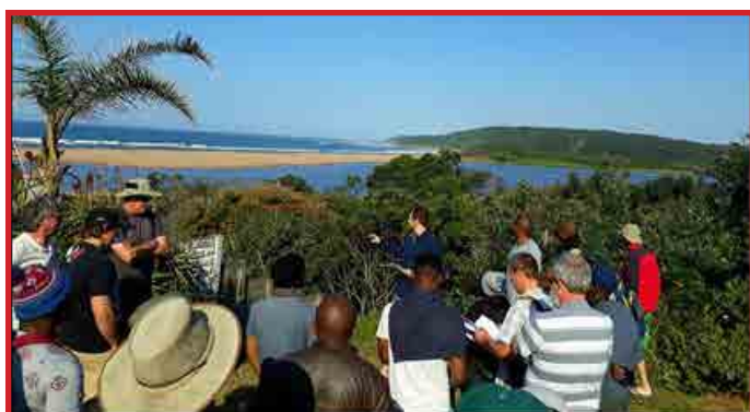
The pre-conference field trip participants at one of the visited sites

July and finished on the 25th July 2017. The excursion had a focus on selected sites covering a range of geomorphic interests/research, starting from slope stability and erosion in the Drakensberg, to Mtunzini along the Kwazulu Natal coastal area (Figure 1) to consider environmental change, to land use issues in the Ulundi area, and entering Swaziland through Mahamba.