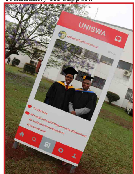
Masters Students taking photographs at the branded photobooth during the 2017 Graduation Ceremony

We recognise the transformational agenda by the University to sustain itself by setting up a holding company to invest in various sectors of our economy. These efforts complement those of the UNISWA Foundation that has now reached out to the global community for support.